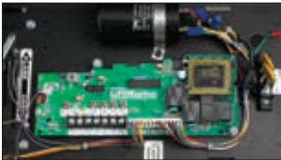
Includes the Medium-Duty Logic Board with Built-In Receiver